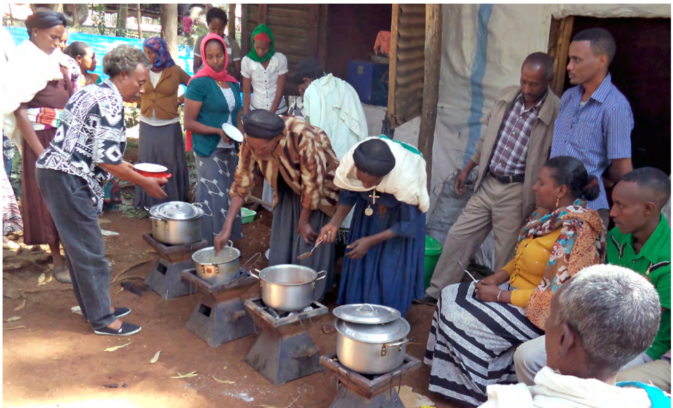
Farmer trainings on QPM-based traditional food preparation.

agriculture [officials, MoARN Extension Services subject matter specialists (SMSs), project woreda supervisors and development agents (DAs)] and health extension agents. This type of short-term training was provided both in workshops and on-the-job training to 47,500 farmers (17,300 or 36.4% were women). As indicated in Table 1, audio-visual based training (DG technology) greatly contributed in reaching more people; 93% of the trainees attended audio-visual based training. Specifically, audiovisual-