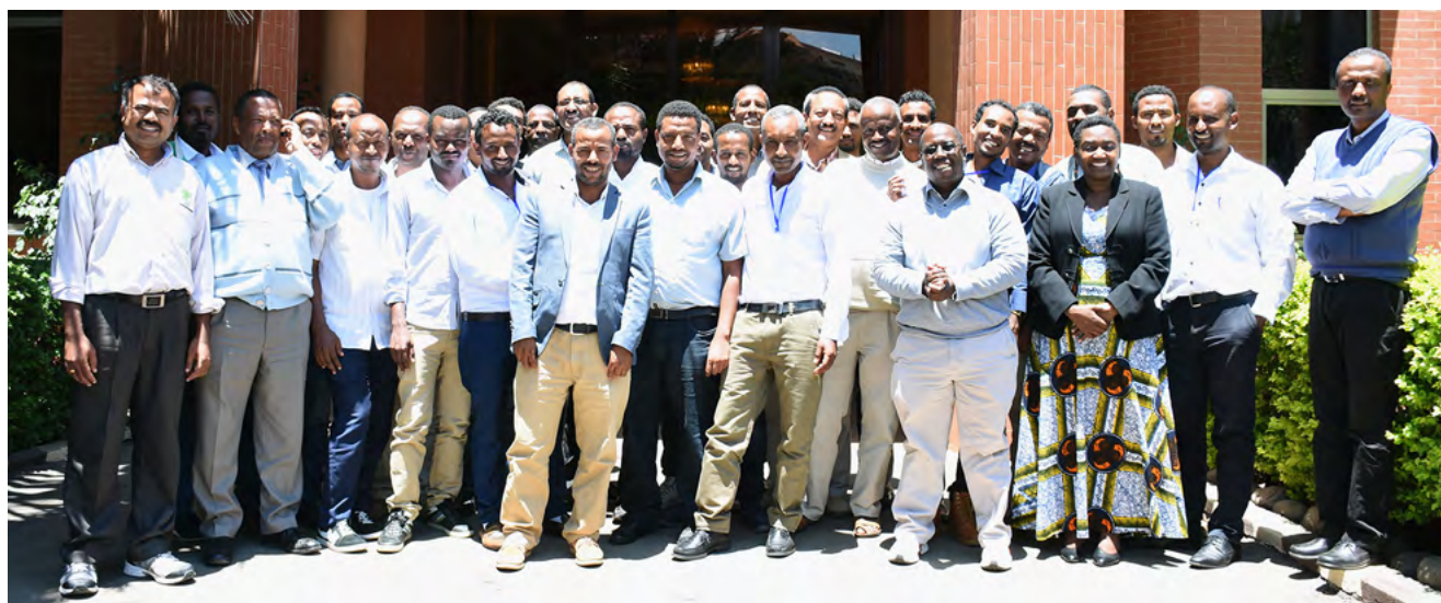
Participants in one of the seed production and quality control trainings.

*Two of the seed production training sessions were funded jointly by the Drought Tolerant Maize for Africa Seed Scaling and NuME projects.