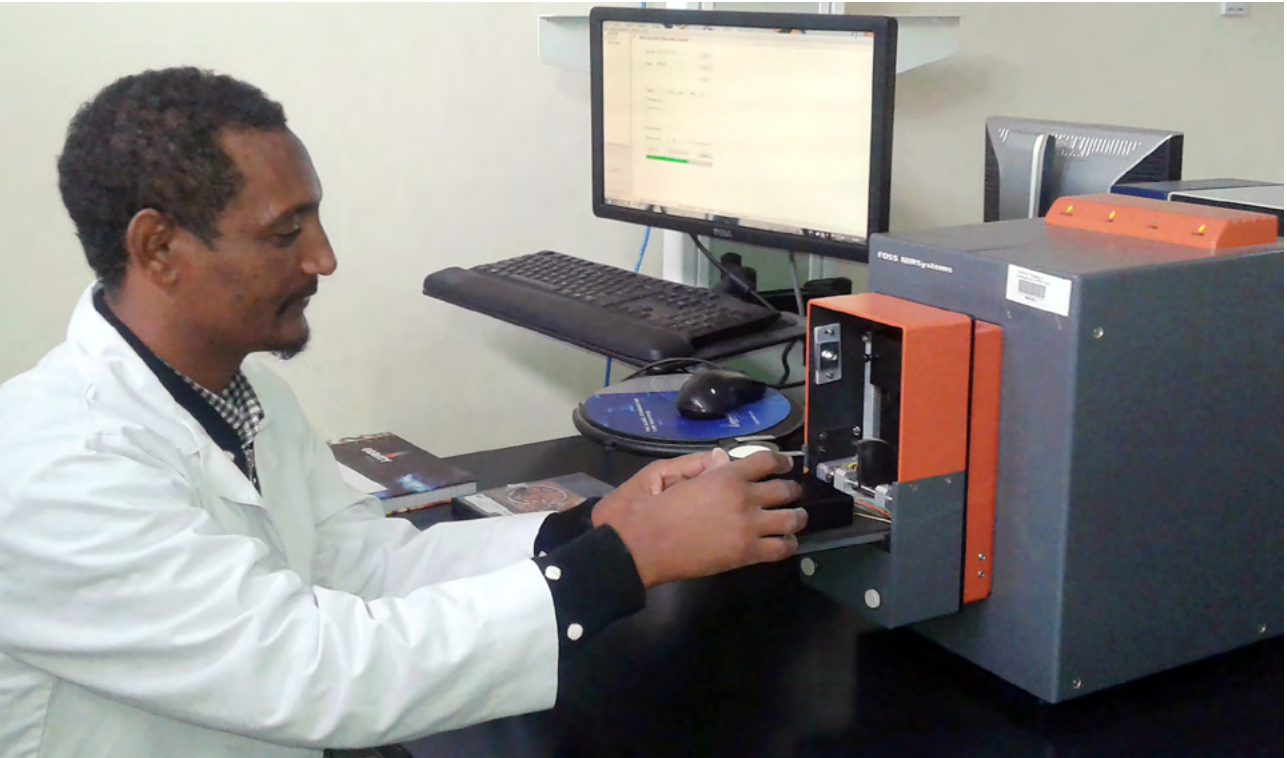
The NIRS MACHine as installed in the AQRL of EIAR.