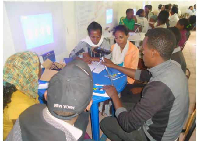
Training of trainers on video-based QPM dissemination for development agents and health extensionists.

It is also vital for capturing the attention of the communities in the target woredas in regards to technology and showing them how to grow and use QPM. To this end, the NuME project has designed short-term trainings for farmers, extension workers (development and health) and professionals working in different partner institutions. The main component of NuME's short-term trainings were to provide field demonstrations for field demo farmers (female and male), staff of bureaus of